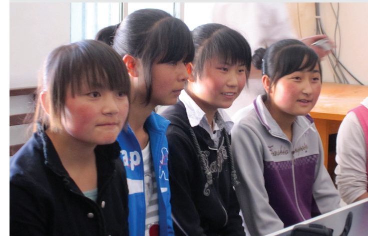
A group of grade 8 and 9 students in Huining County – without financial help most of them are not able to attend high school

In rural regions girls are often forced to quit school at age 15 or 16 to support the family and their male sibling's education; or marry early. Many peasants went to the cities in East China to find work and left their children alone or with aging grandparents. Because of the distance between the villages and the schools, many rural middle school and high school students are boarding. They can afford only one hot meal a day.