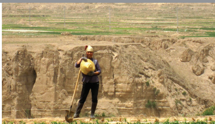
Barring Landscapes Gansu

If you commit to sponsor a student for the full duration of her study, you will receive an annual report on her progress from EGRC.