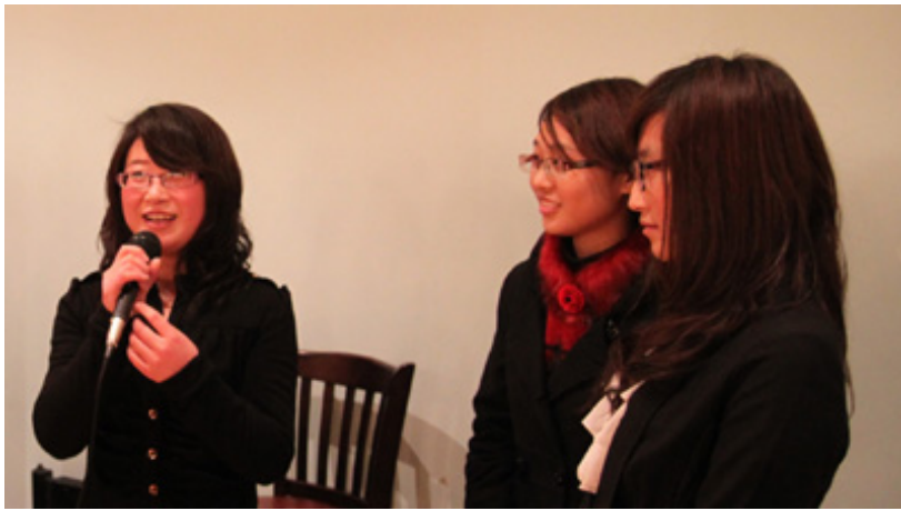
Three EGRC students attended the party